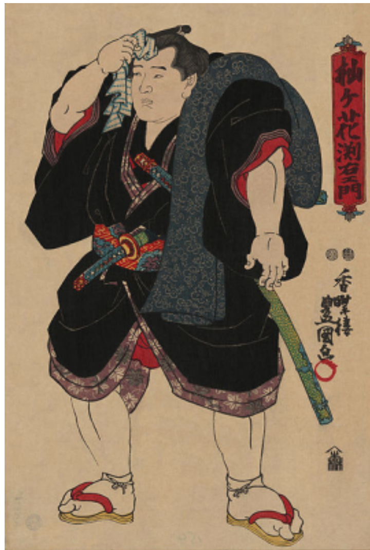
Sumo wrestler Somagahana Fuchiemon, c. 1850

Sumo (相撲, sumō ?) is a competitive full-contact sport where a wrestler ( rikishi ) tries to force another wrestler out of a circular ring ( dohyō ) or to touch the ground with anything other than the soles of the feet. The sport originated many centuries ago in Japan, the only country where it is practiced professionally.